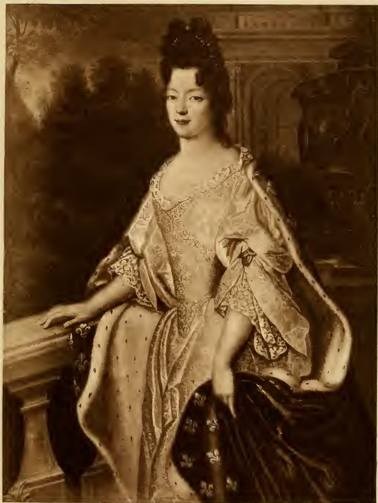
The Duchesse de Bourgogne